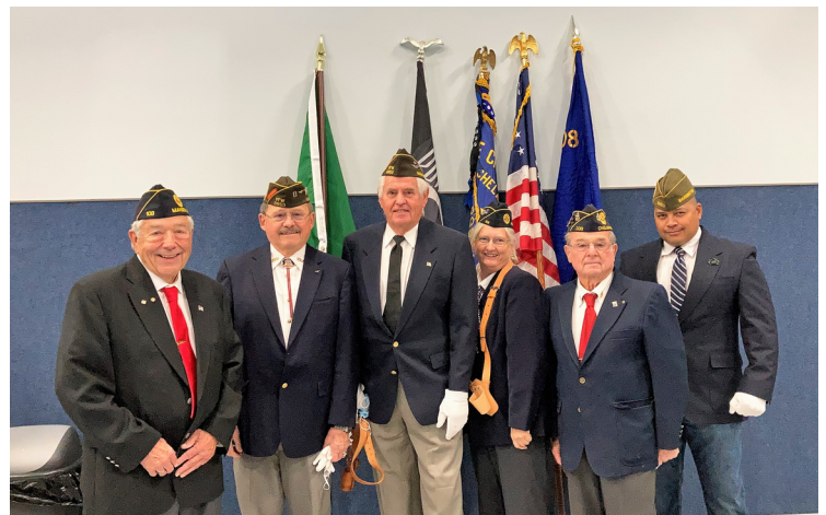
Manson American Legion Post 108 and Chelan VFW Post 6853 came together to present the colors on Nov 8 th at North Shore Bible Church's Veterans Day event.

In North Central Washington, we love our Veterans so much that Veterans Day events typically span nearly a week, from assemblies at the area schools, to parades, to luncheons, and more. With 2020 being the way that it is, a lot of these events were canceled, however I did hear that some continued with safe modifications. I did not receive a lot of photos or stories, but what I did hear about was posted on the website at www.ncwveterans.info/news - if you have a story or any photos to share, please send it my way and I'll get it posted as well.