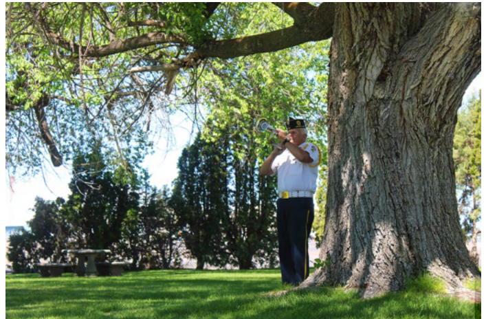
87 Forgotten Heroes Memorial, Moses Lake – AL Post 209 and others held a service to honor those lost at the Port of Moses Lake in a fatal crash during Operation Sleigh Ride on 20 Dec 1952; full story at https://tinyurl.com/ml-memorialday2021