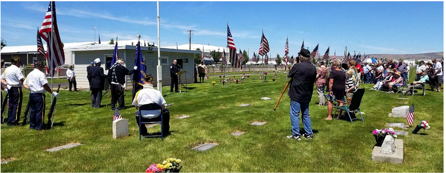
Quincy Valley Cemetery, 31 May – VFW Post 24 & AL Post 183 participated; photo by Rachel Pinkerton, Columbia Basin Herald

If you have photos or a story to share, reach out to whatsnew@ncwveterans.info and I'll get it posted on the website for everyone to see.