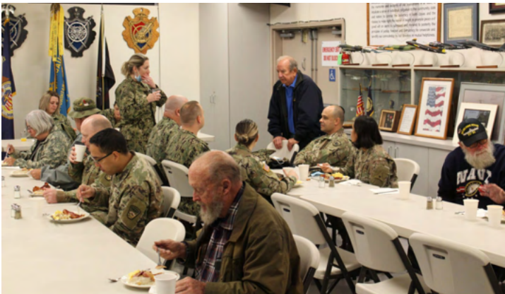
Pre-parade breakfast at Wenatchee Legion Post 10

https://ncwveterans.info/local-events/veterans-day-2021-returning-to-normal/