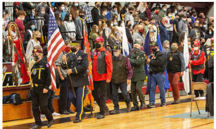
Veterans walking out the Colors at Lake Roosevelt School Veterans Day assembly