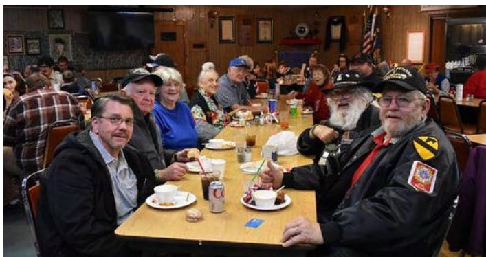
Post-parade Lunch at Legion Post 28 in Ephrata; photo rcvd via email from Grant Co VAB