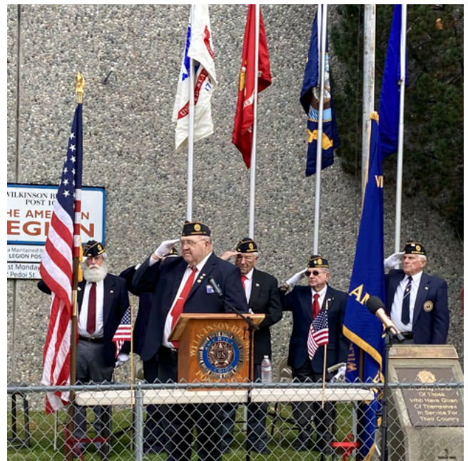
Manson Legion Post 108 members salute during the playing of Taps; photo from Facebook