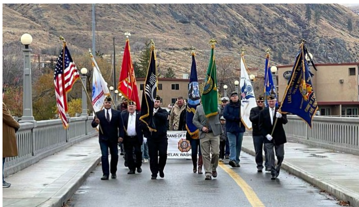
Chelan VFW Post 6853 leading the parade in Chelan