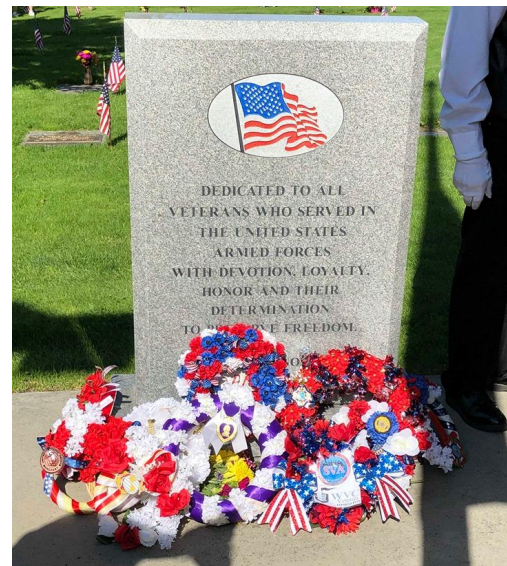
East Wenatchee Cemetery