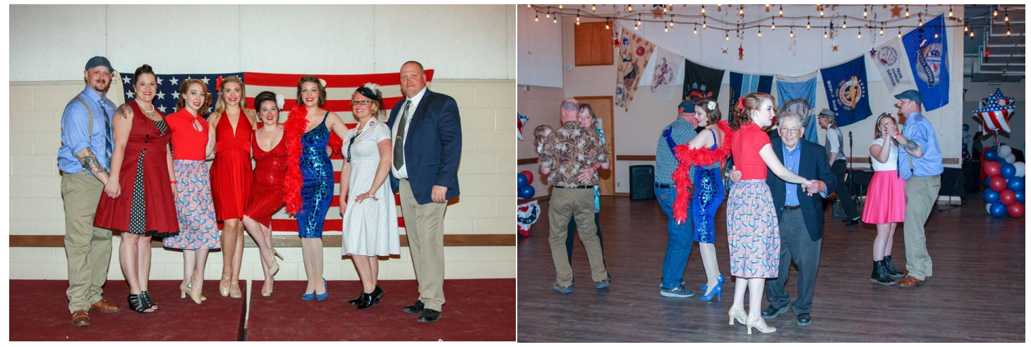
More photos online – www.facebook.com/OpCreate

Our WWII themed community dance and launch event for Operation Creation went really well. Everyone loved the Pin Ups on Tour and felt the entertainment was top notch. With around 100 attendees, many from Wenatchee, we raised just over $1,000 while gaining valuable exposure and directly connecting with our community. We made sure to honor those WWII veterans that came out, as well. If you missed it, fear not! We are already planning our next annual event.