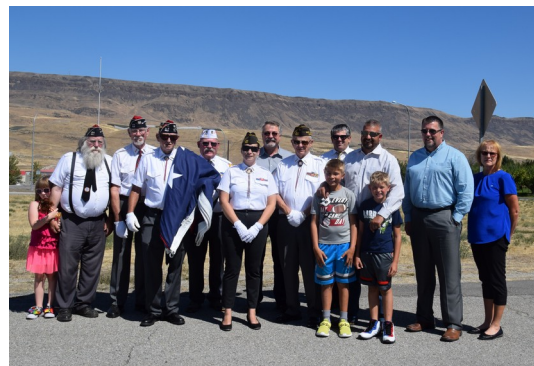
VFW Post 3617 Color Guard with Douglas County Commissioners and WA Trust reps at Pangborn Traffic Circle, Aug 27 th .

Douglas County Commissioners, Washington Trust representatives, and the Color Guard from Wenatchee Valley VFW Post 3617 gathered August 27 th at the Pangborn traffic circle to install a new 20' x 30' flag. The flag was provided by Washington Trust Bank. Post 3617 volunteers have adopted the duties of lowering and raising the flag for commemorative events (previously handled by Douglas County facilities department).